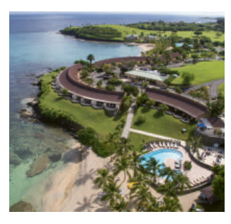
Ahove an aerial view of the Ruccaneer Right a guestroom with ocean views at the resort.

Grotto Pool and has added a restaurant, Beauregard's, serving small bites, salads and