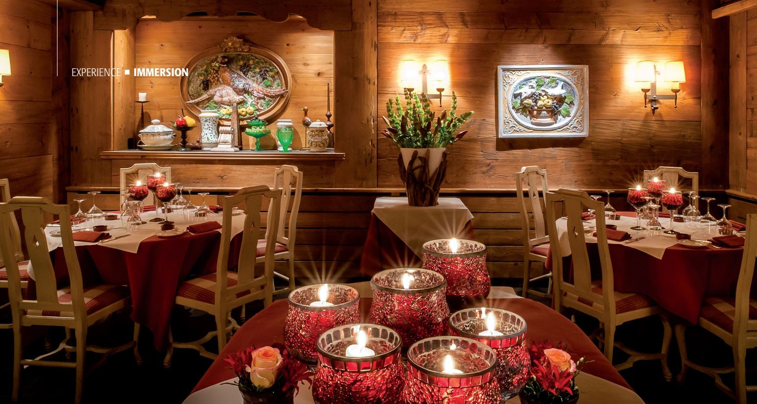
Gildo's Ristorante serves authentic Italian fare prepared by Venetian chefs in a homey, Alpine lodge setting.

designer labels along the promenade (Cartier, Hermès, Prada, etc.), the principal appeal once things cool down in the region lies on piste. While other resorts across Europe become inundated with tourists at the drop of the first snowflake, the sumptuous slopes surrounding Gstaad have managed to remain mostly uncluttered, making it the perfect place to hone your skills on wide-open runs on a variety of terrains that range from bunny slopes to off piste.