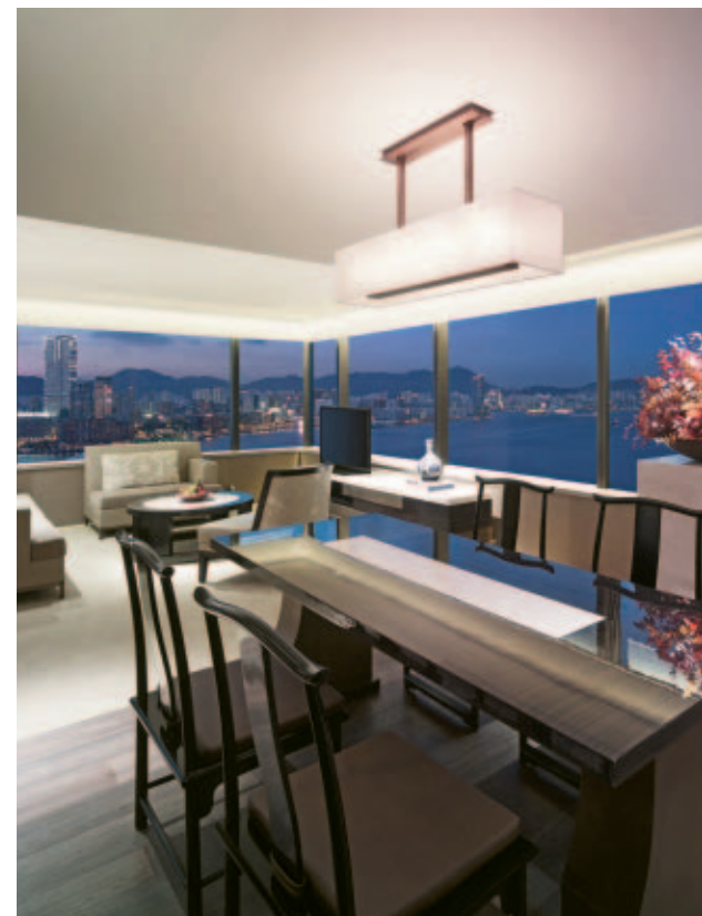
Left, the renovated Plateau Spa and fitness center has attentive personal trainers and staff. Above, the Grand Executive Harbour Suite offers 180-degree views of Victoria Harbour.