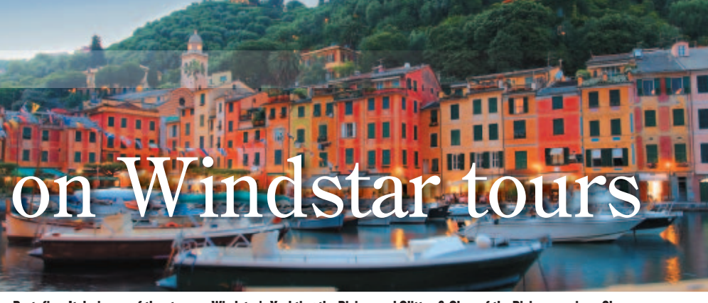
Portofino, Italy, is one of the stops on Windstar's Yachting the Riviera and Glitter & Glam of the Rivieras cruises. Shore excursions in Portofino include the Splendido Olive Oil and Lunch and the Walking Tour & Wine Tasting at Brown Castle.

Both the Splendido Olive Oil and Lunch and the Walking Tour & Wine Tasting at Brown Castle shore excursions are priced at $149.